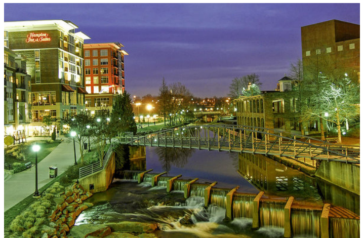
Downtown Greenville, SC

For more information, contact tim.hanks@furman.edu