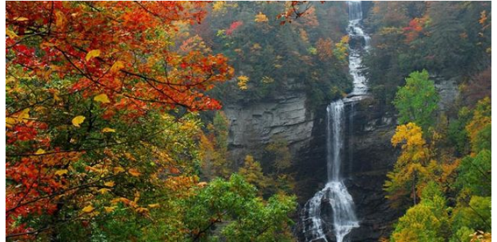
Mountain Drive & Hiking

Keynote Speaker and Ambassador to Malawi, 2015-2019