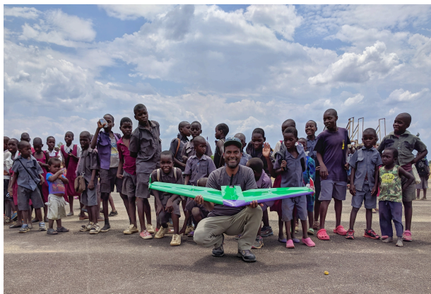
Mapping for a Change in Africa